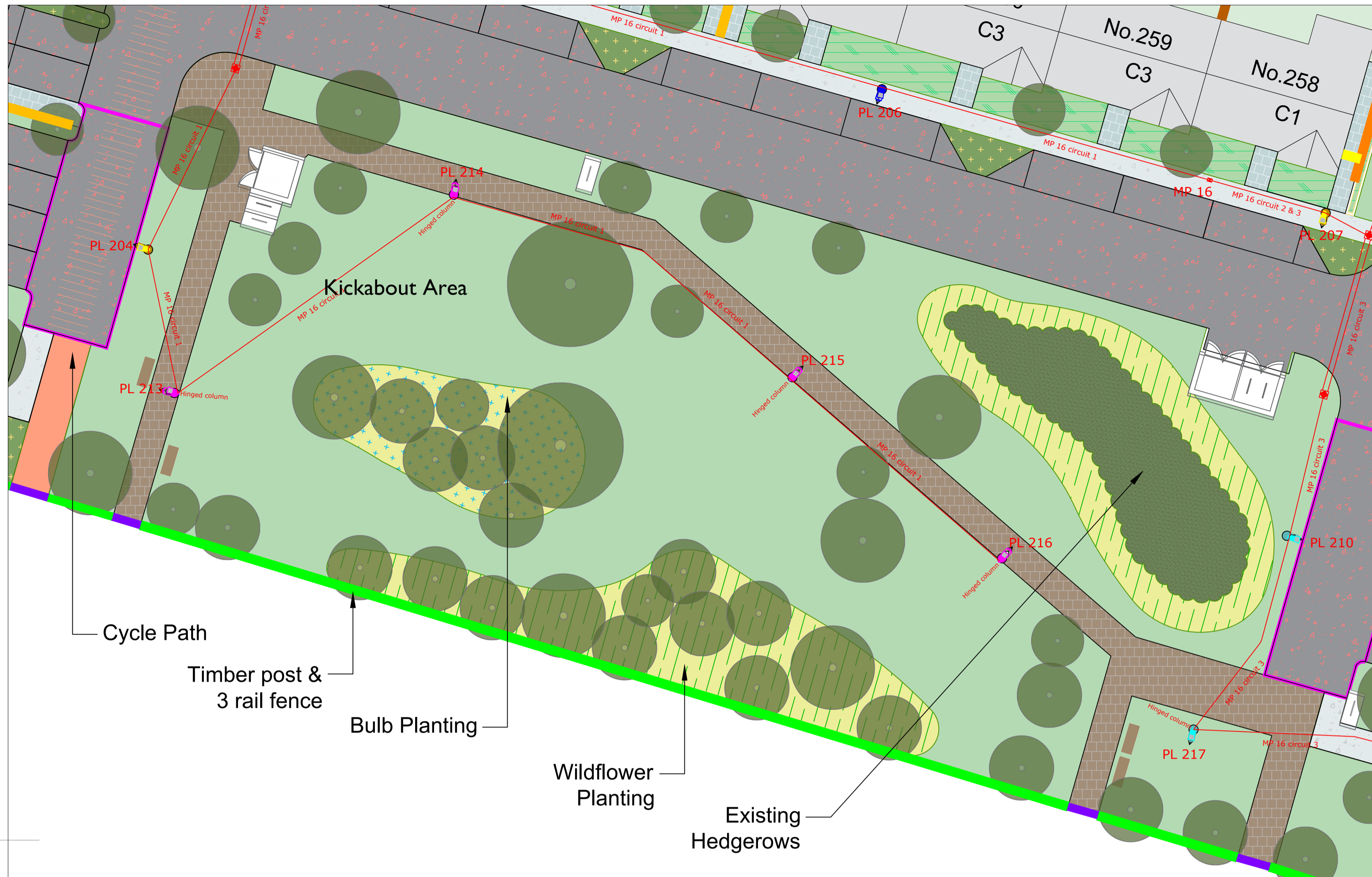
Pocket Park 3 - sc. 1:200